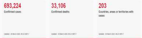
Coronavirus disease (COVID-19) outbreak situation

https://www.who.int/emergencies/diseases/novel-coronavirus-2019